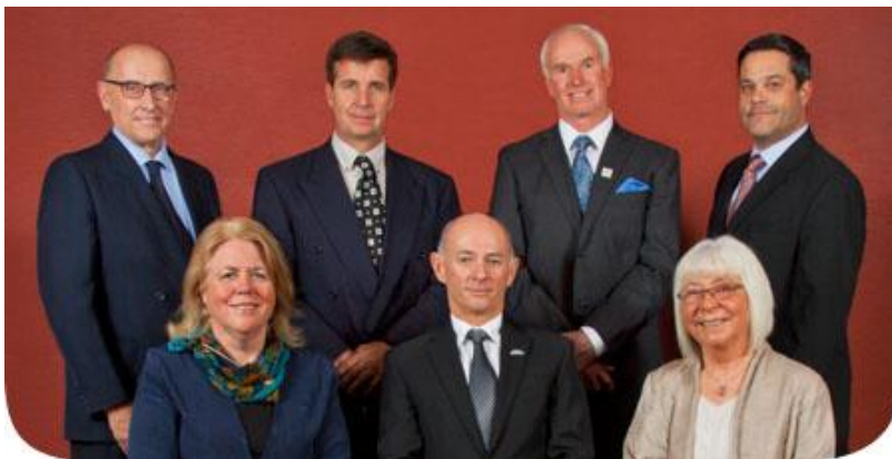
Municipality of Jasper Mayor and Council

The Municipality of Jasper Strategic Priorities for 2013 to 2017 are based on the Jasper Community Sustainability Plan reflecting our community's aspirations for the future and articulating clearly how we intend to get there. From organizational to fiscal health, relationships and communications, our intention is to pursue the bright and optimistic future of our community, guided by the best interest of our residents.