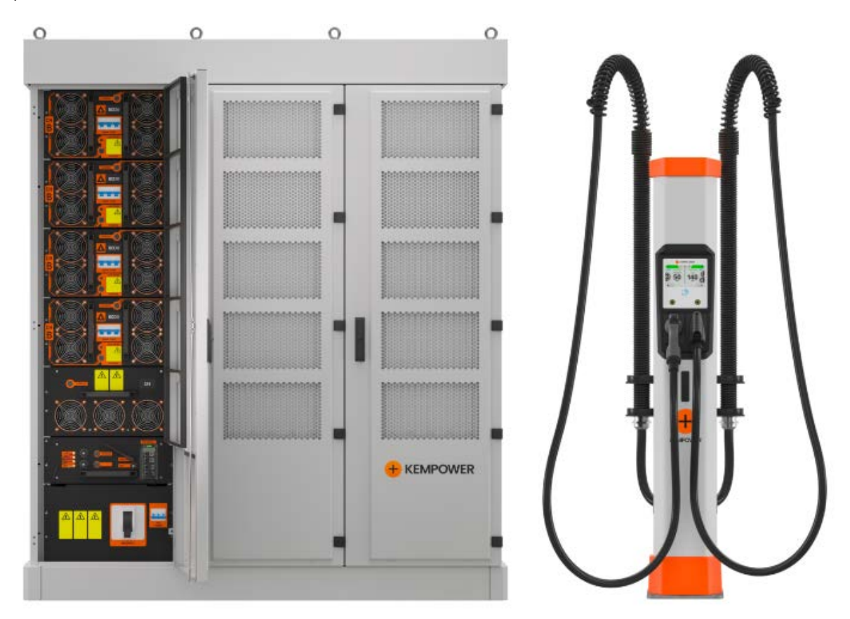
Figure 1: Kempower triple power-cabinet showing 4 power modules per cabinet, and a dual-port dispenser

drivers to use while also holding up to Canada's harsh winters. The extended cable length and user-friendly cable management system are designed to maximize customer satisfaction, facilitating a smooth and efficient charging process for all users.