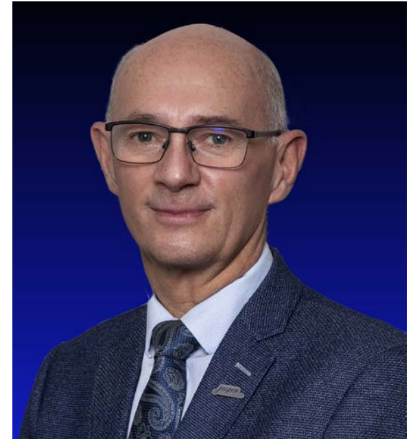
RICHARD IRELAND Mayor

Encompassed within this collection of themes, Council has identified 31 individual strategic actions. It is essential to recognize that just as our community is an integrated whole – and much more than the sum of its parts – this document is similarly intended to be read and understood as an integrated whole: that each identified action does not stand alone; that they work in unison, and that each may fit within and advance any number of Strategic Priorities.